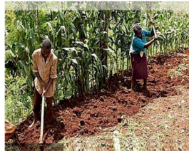
Human energy for farming