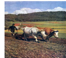
Farm with Animals plough or tractor powered by biofuels