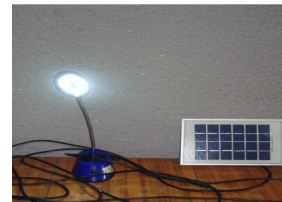
Electricity from sun, wind small hydro. biofuels etc