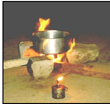
Three stones stove and wick lamp

More than 85 % of the Tanzanians depend on the following inferior energy sources and technologies.