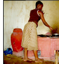
Improved firewood-oko stove

Support greater use of the following modern energy technologies